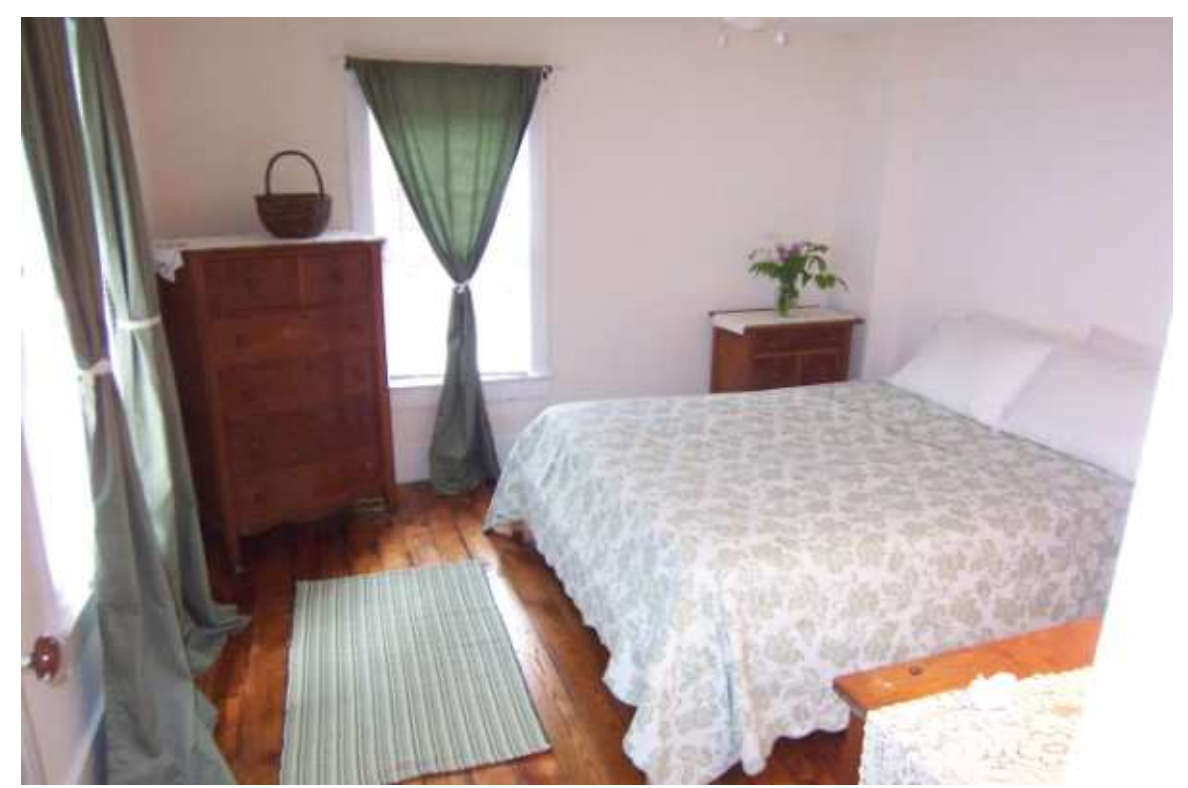
Master Bedroom with Queen Platform Bed. Scallop Edge Chest of Drawers and Wash Stand from 1912 Wildmere Hotel North End.