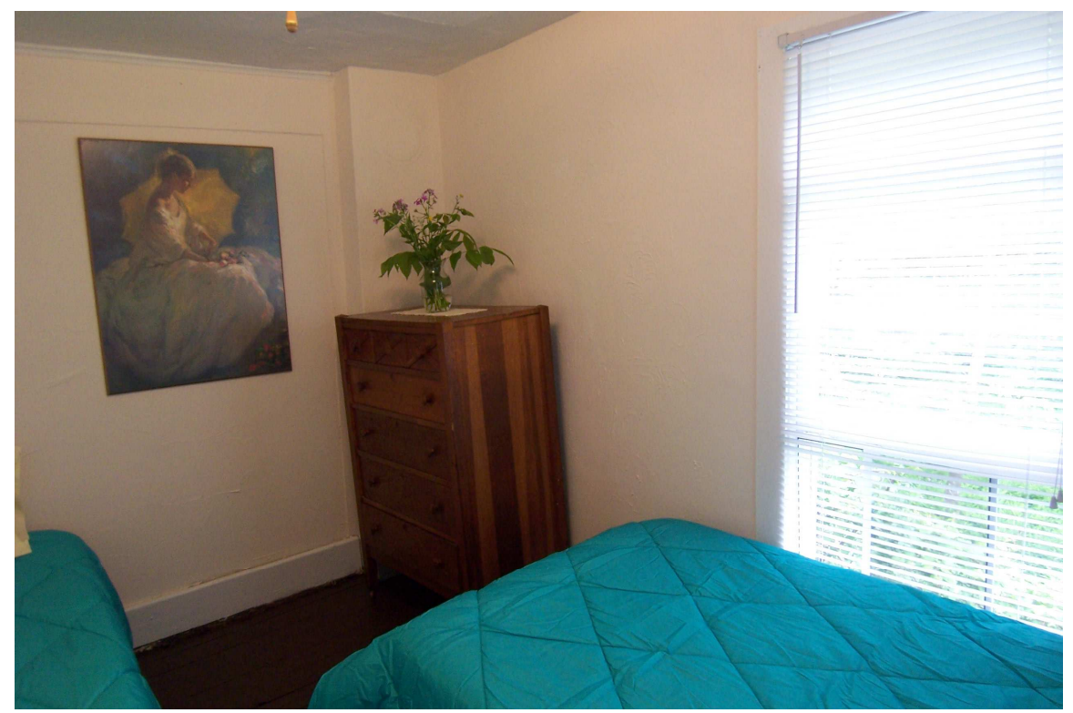
Twin Bedroom – Window view