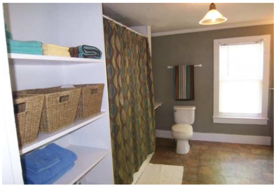
Spacious Bathroom with Storage Shelves