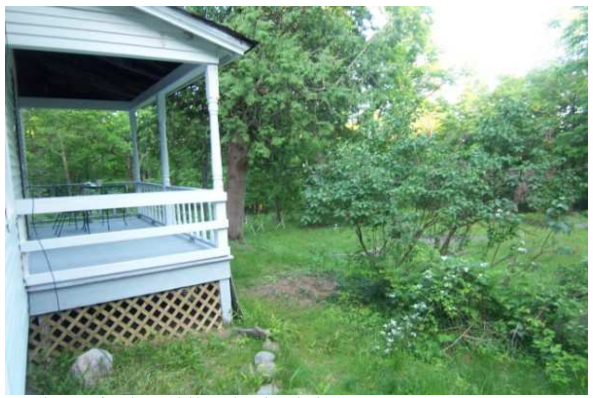
Veranda view to front lawn with lilac and raspberry bushes

The Shawangunk Mountains are one and one-half hour's drive from Manhattan, five hours from Boston or six hours from D.C.