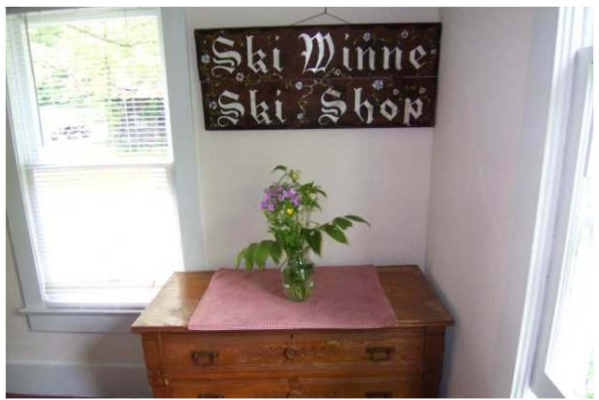
Bunk Room with 1879 Carved Chestnut Wildmere Dresser Base & original hand painted Ski Minne sign.