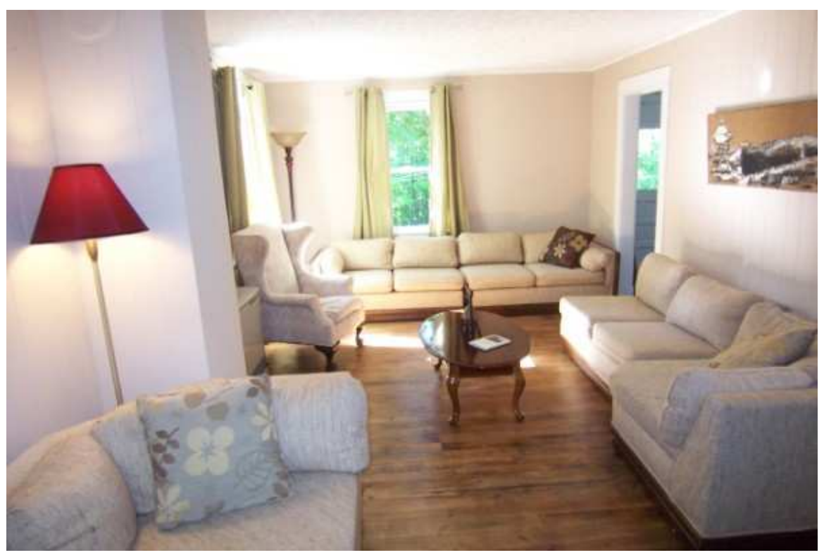
Great Room in Morning Light - Furnishings from Windsong

The house, recently renovated with all rooms freshly painted, is fully furnished for turnkey rental. The former owners of Lake Minnewaska have supplied the cottage with many antique furnishings from the former Lake Minnewaska hotels – Cliff House and Wildmere. The Master Bedroom has a queen bed. A bunk bed and two twin beds are in the second and third bedrooms. All mattresses and pillows are new. Linens for beds and bath supplied. The cottage is ready to enjoy – just bring your personal effects, relax and enjoy the summer and fall in the Shawangunk Mountains, only 90 miles from New York City.