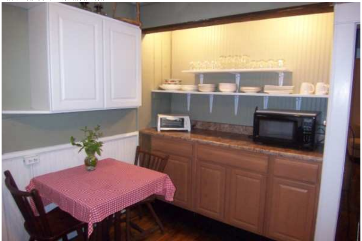
Eat In Kitchen with Ski Minne Table & Chairs