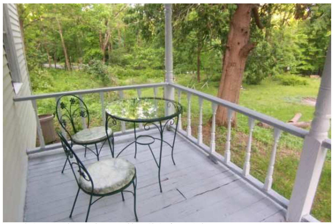
Veranda Seating with Wrought Iron Table & Chairs from Windsong