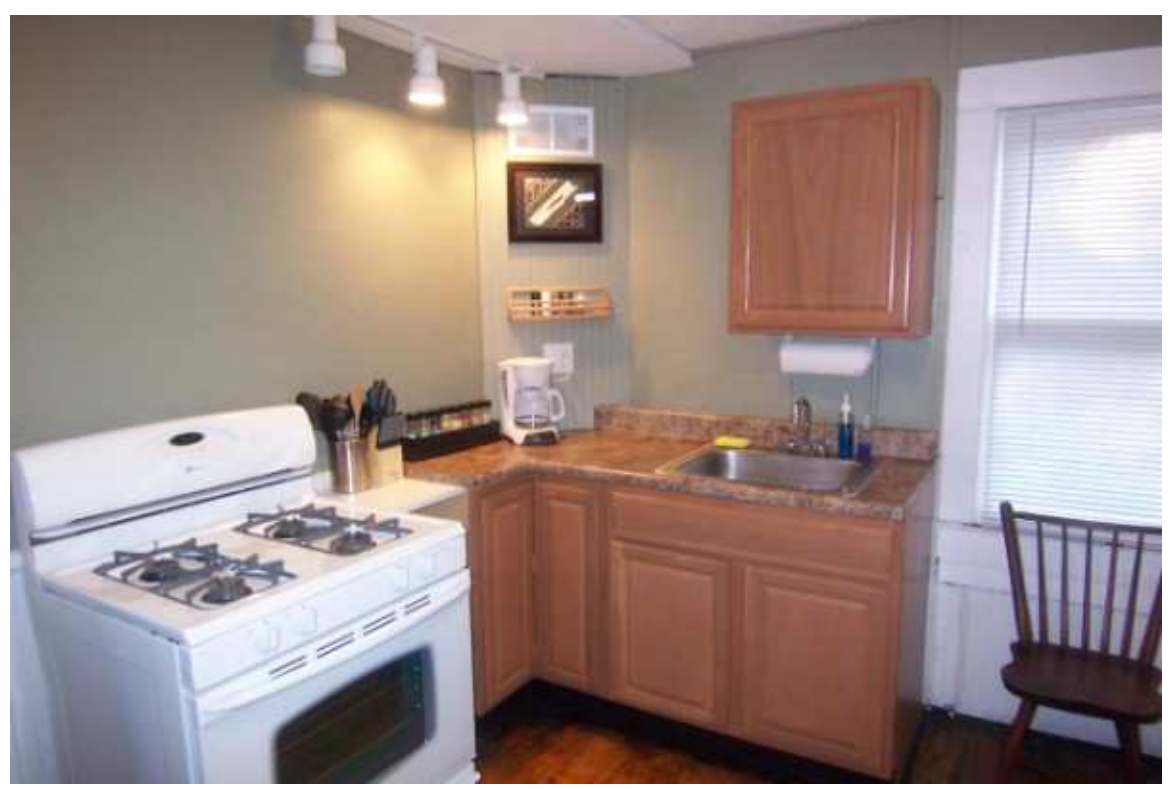
Country Kitchen with gas stove