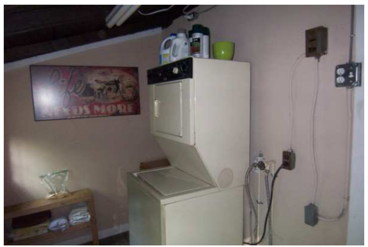
Laundry & Storage Area