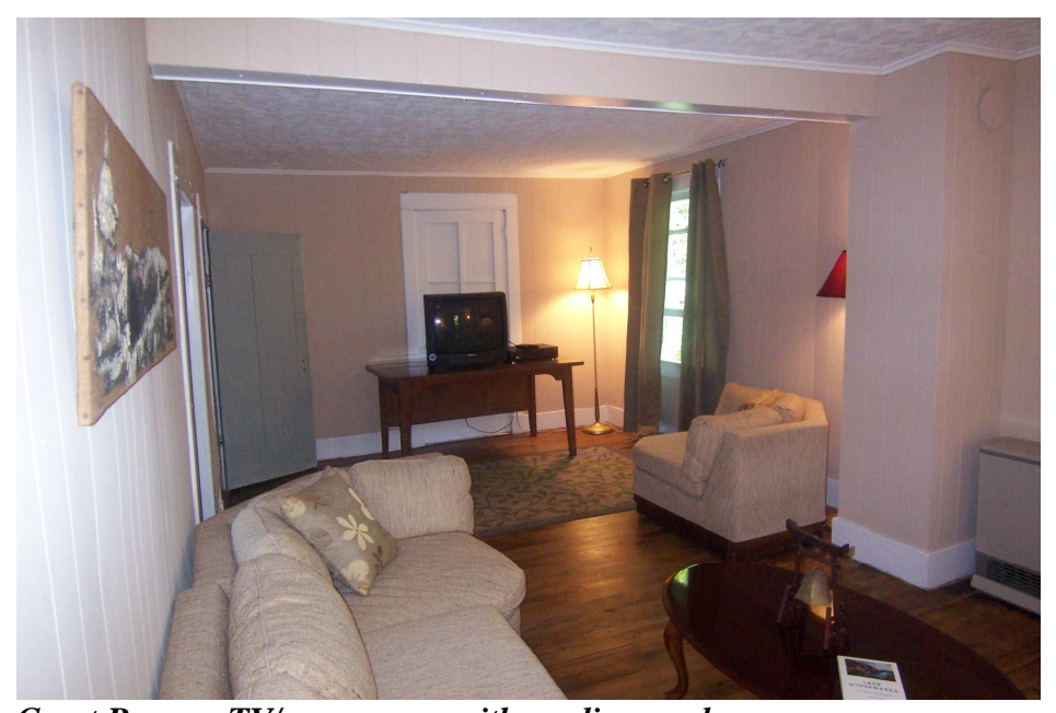
Great Room - TV/games area with reading nook