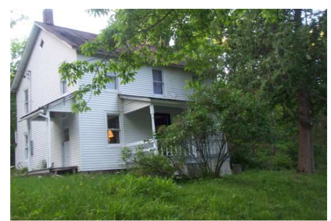
School Master House

This private residence is located only 1,000 feet from the Lake Minnewaska State Preserve's Peterskill Office, 200 paces from The Minnewaska/Mohonk Carriage Way and one road mile from the State Preserve's Main Entrance. The recently renovated