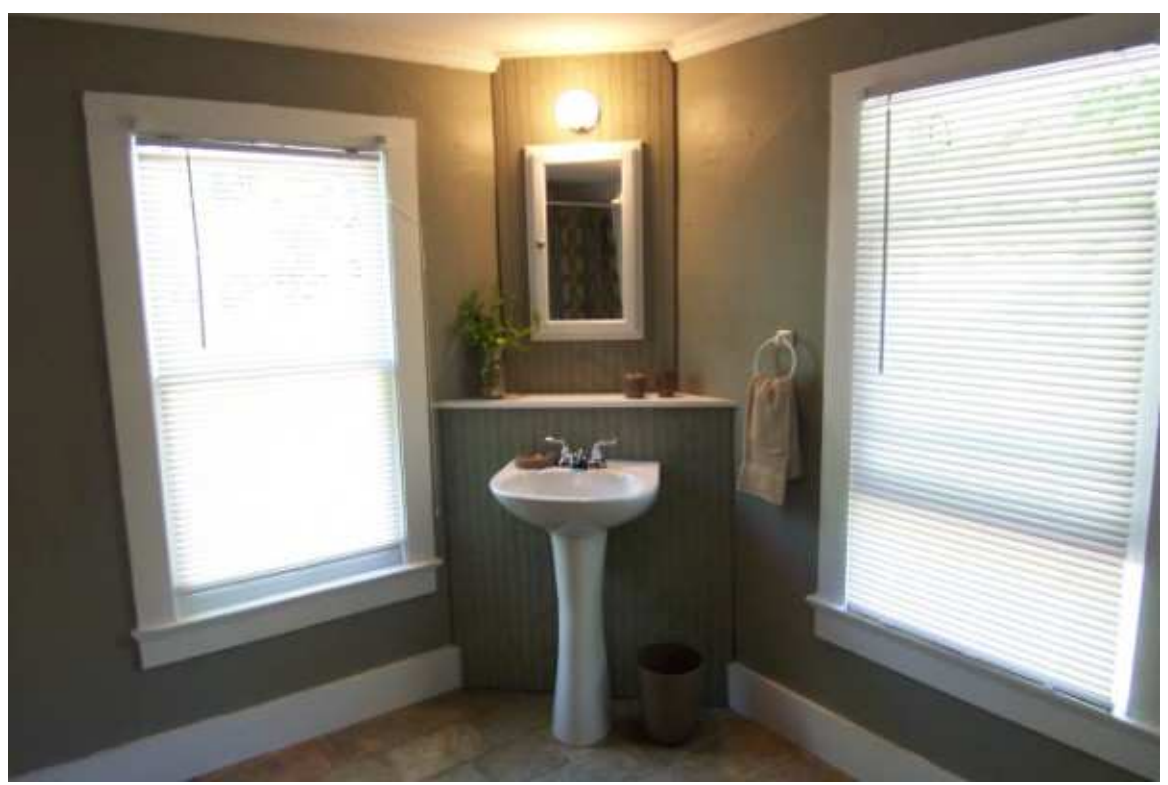
Bathroom with Pedestal Sink