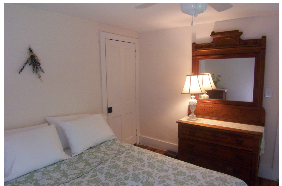
Master Bedroom with 1889 Carved Chestnut Dresser from the Wildmere House. Marble lamp from Windsong.