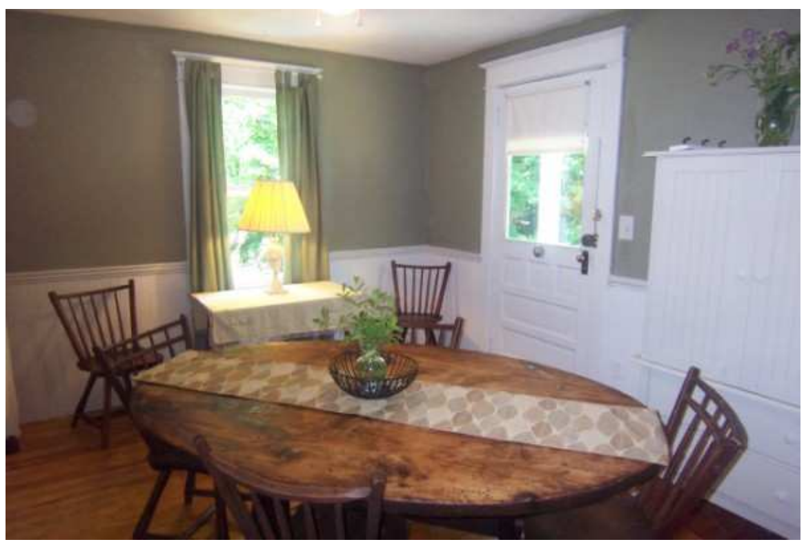
Dining Room with Hunt Country Table & Chairs from Ski Minne.