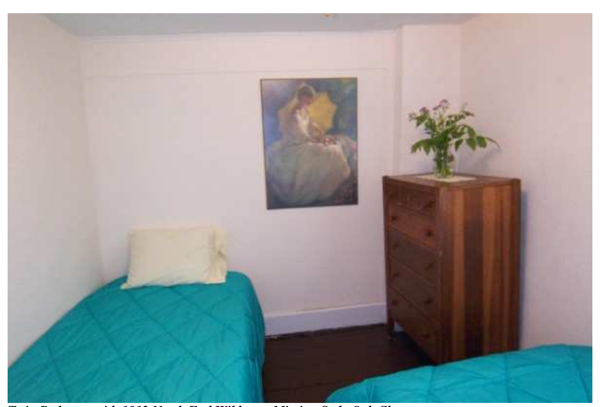
Twin Bedroom with 1912 North End Wildmere Mission Style Oak Chest