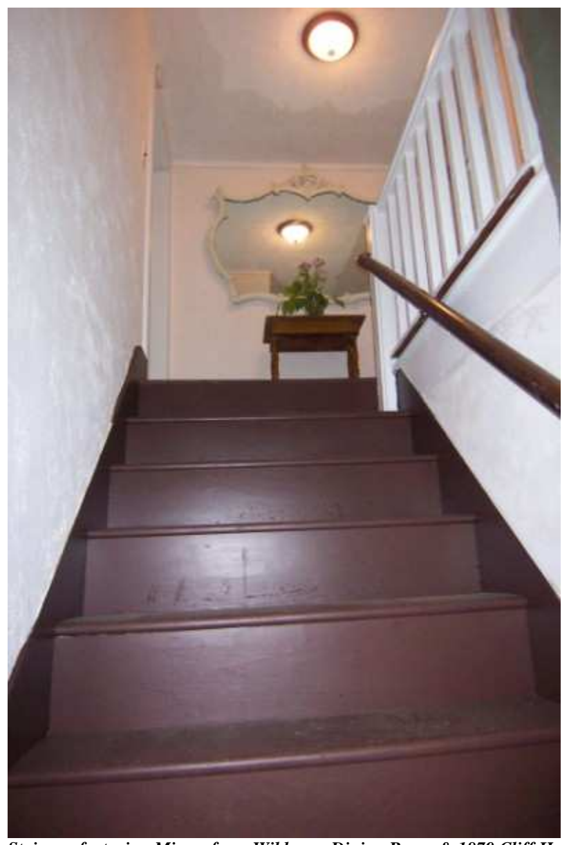
Stairway featuring Mirror from Wildmere Dining Room & 1879 Cliff House Writing Table