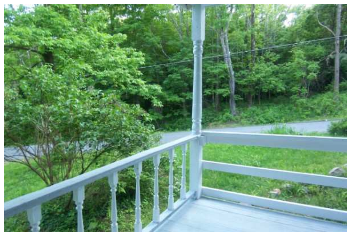
Veranda View to Mohonk Trust Preserve